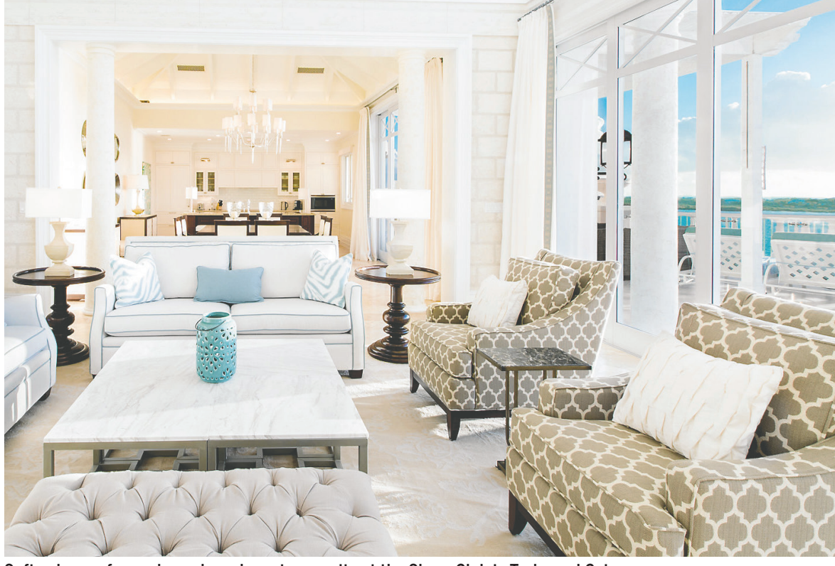
Soft colours of sea, sky and sand create serenity at the Shore Club in Turks and Caicos. THE SHORE CLUB

The Shore Club is medium size in terms of accommodations -106 sumptuous suites and six gated villas — but it's grand in scope, with many more facilities than one would expect: two appealing dinner restaurants, an ultra-modern fitness club with tennis, the Dune Spa, a glorious beachfront and four swimming pools (one for adults, one for laps and two with bar-bistros). And for the kids, Jungle Jam has supervised activities, at no extra charge.